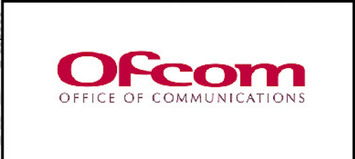
Swindon & West Wiltshire AM MCA (Classic Gold 936/1161) - 29th December 2003