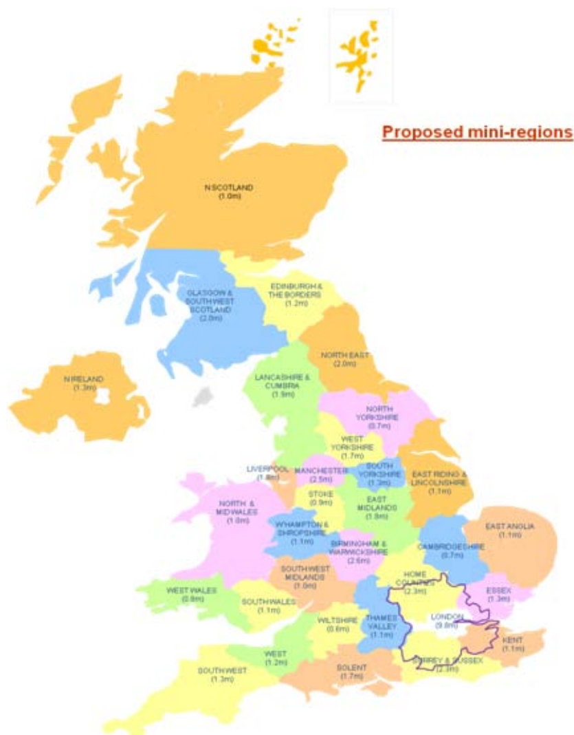
Figure 6: Proposed new mini-regions