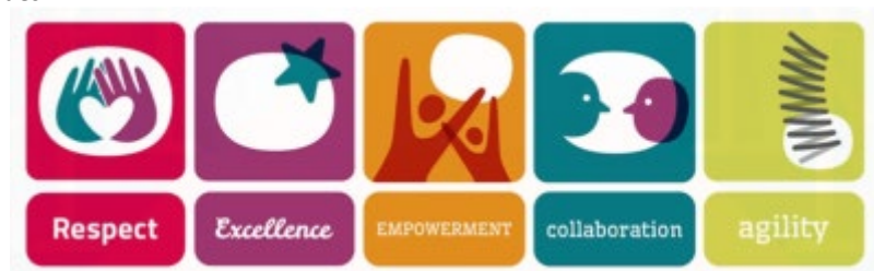
Figure 1: Ofcom Values

Ofcom exists to make communications work for everyone. We employ over 1200 people across the UK. Our corporate values are Respect, Excellence, Empowerment, Collaboration and Agility. These are central to our effectiveness, and they support the organisation we want to be, guiding us in how we work together to deliver our objectives including how we work with our suppliers.