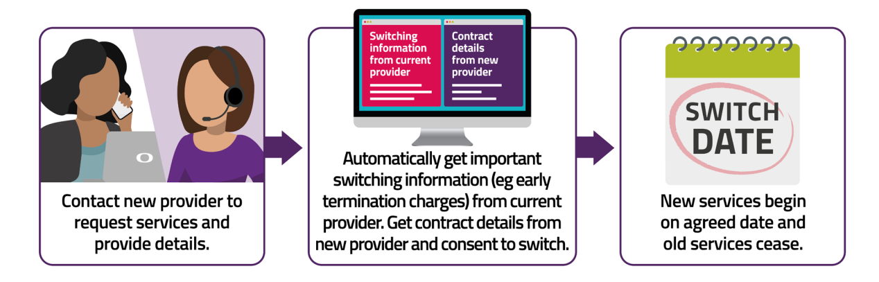
Table 2.2: One Touch Switch process steps