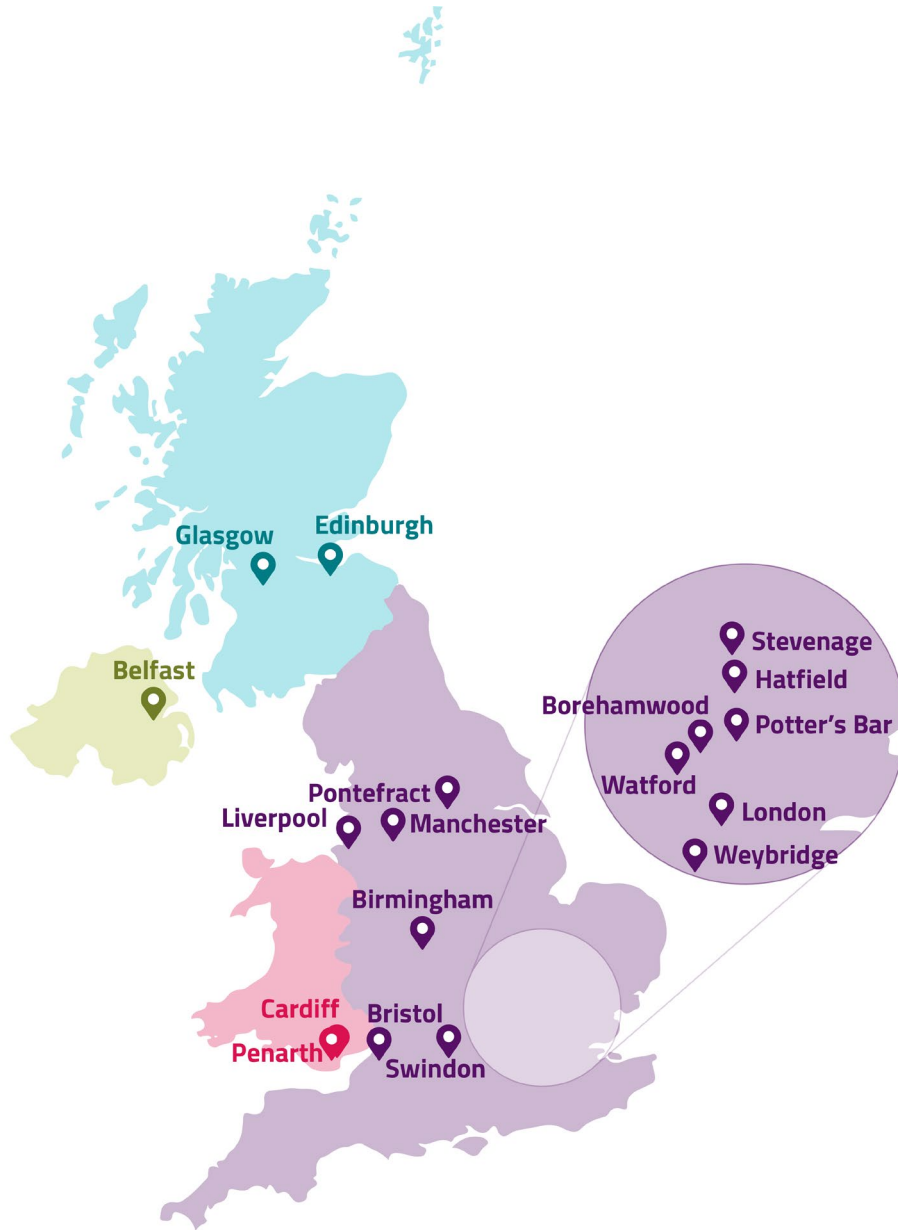
Figure 4.1: Towns and cities where we have conducted measurements