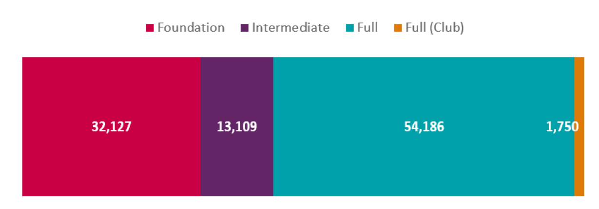
Figure 2: Number of amateur radio licences on issue