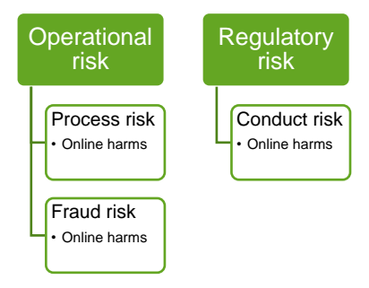
Figure 2: Operational Risk and Regulatory Risk

Given the wide-ranging nature of online harms risk, and the different approaches that are likely to be adopted to manage such risks, best practice would be for firms to break this risk down into different classes and types of online harm. It is common for an industry to desire some level of consistency in the taxonomies used to classify risks, as it facilitates the sharing of knowledge between firms and enables the regulator to identify thematic trends.<sup>9</sup>