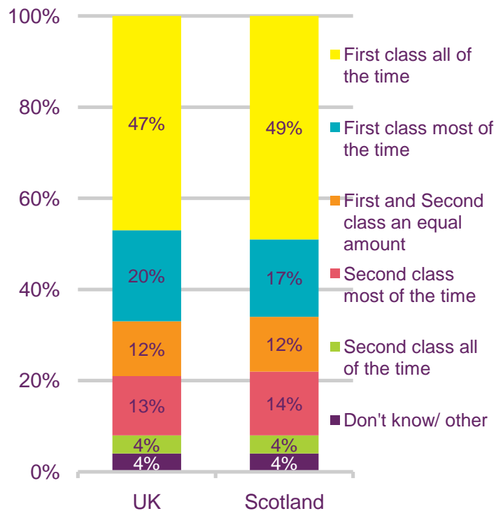
Proportion of letters/ cards that must be at their destination next working day