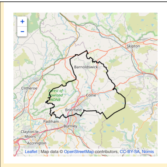
Map showing the outline of Pendle Borough with Barnoldswick to the north and Burnley to the south.

We would propose to reach all of Nelson and as far as Colne and Barrowford because Pendle Community Radio's target audience of Asian/British Asian makes up 18.8% of the borough's population and these individuals could be deprived of a community radio service in a digital world. It should be noted that the area of northern Nelson and up to Colne is a 'hinterland' falling between two polygons, covered by neither. Indeed, it might be argued whether this proposed coverage is in fact actually beyond the intended area of the polygon.