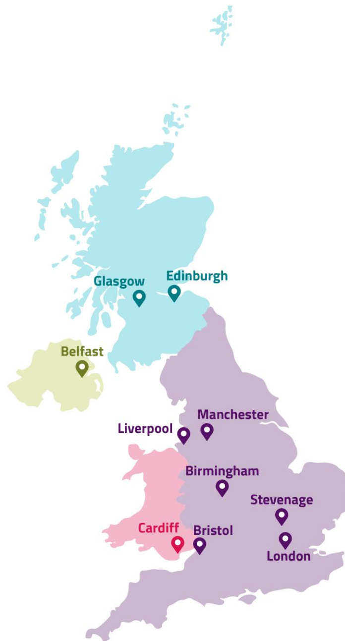
Figure 4.1: Cities where we have conducted measurements