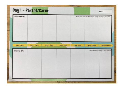
Example of parent media journal

In-home interviews were arranged to take place in the homes of participating families following the completion of their media journals and an introductory phone call with the researcher conducting the interview. Home visits lasted approximately four hours. These visits included two separate interviews: one with the parent and one with the lead child, as well as an hour of 'observation' during which the researcher was able to learn more about family relationships and communication at home.