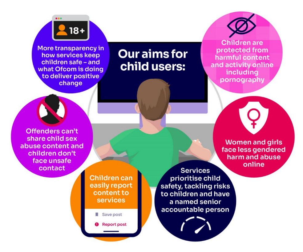
Figure 3.3: Our aims for child users