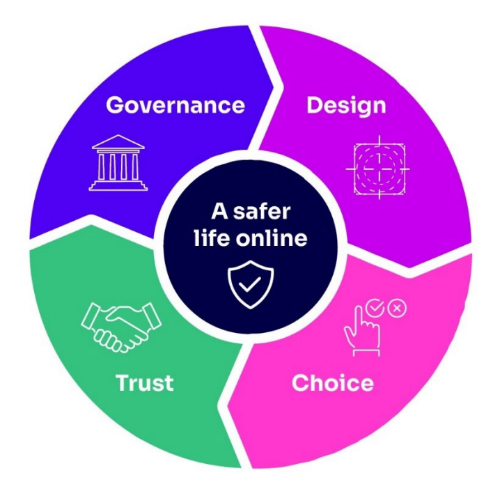
Figure 3.2: A safer life online for people in the UK