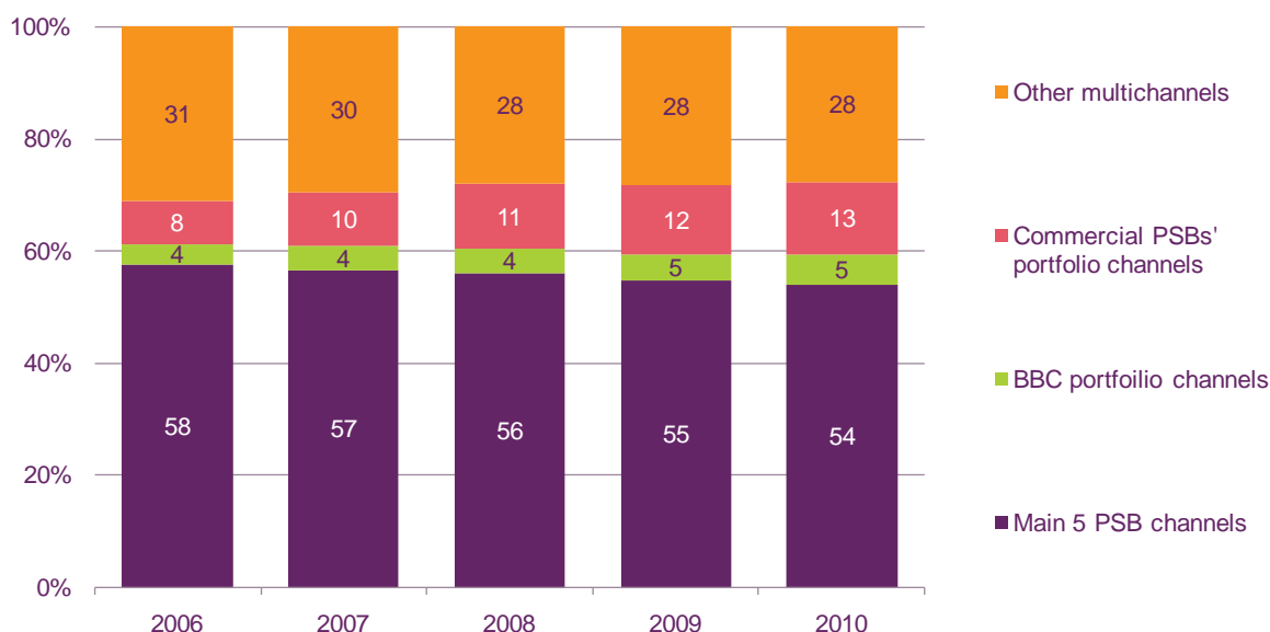
Figure 6 Share in multichannel homes: 2006-2010

Source: BARB, 2006-2009 = All individuals, multichannel universe; 2010 = All individuals in multichannel homes, network universe. PSB portfolio channels are the BBC digital channels plus commercial PSB digital channels, e.g. ITV2, ITV3, E4, more4. The actual number of channels that make up the PSB portfolios has increased over the years, and the proportion of people with multichannel television has also grown substantially year on year. Note: New BARB panel introduced 1 st Jan 2010. As a result pre- and post-panel change data should be treated with caution.