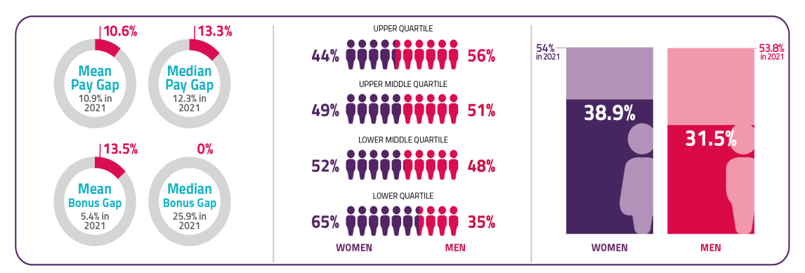
Figure 3: 2022 Gender Pay and Bonus Gap (vs 2021), % of men and women by pay quartile and % of men and women receiving a bonus