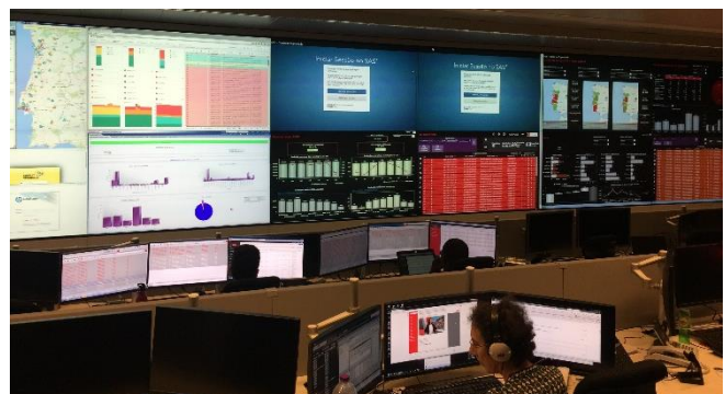
Typical utility distribution control room