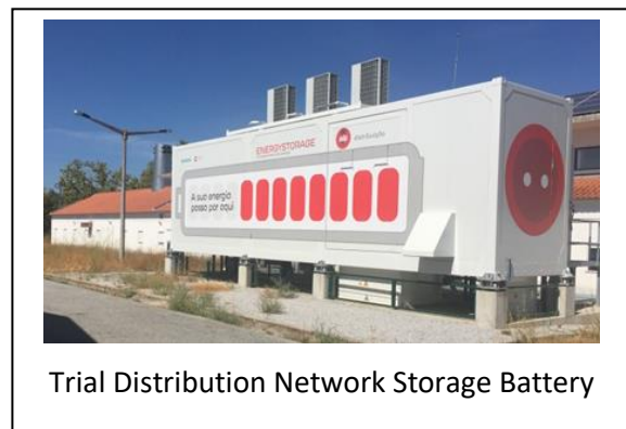
Trial Distribution Network Storage Battery

EUTC welcomes Ofcom's recognition that "The electricity sector has a requirement for increased operational connectivity throughout the electricity network to support the shift to renewable power generation and the electrification of transport and heating, both of which underpin government objectives to deliver net zero." And that "These future requirements may be best met by the deployment of private wireless networks, for which the availability of suitable and sufficient spectrum may be necessary."