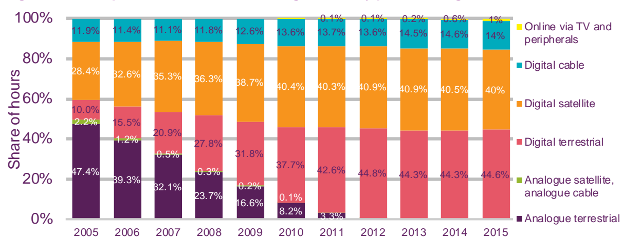
Figure 3.1: Proportion of total TV viewing hours, by platform signal

3.15 More than four in ten UK households are DTT-only, corresponding to over 10 million households (Figure 3.2). The number of households with satellite or cable subscriptions in 2014 was similar to the numbers in 2010. Switching between TV providers, at 3 to 5% per annum depending on platform, <sup>22</sup> is lower than for other communications services in the UK (Figure 3.3).