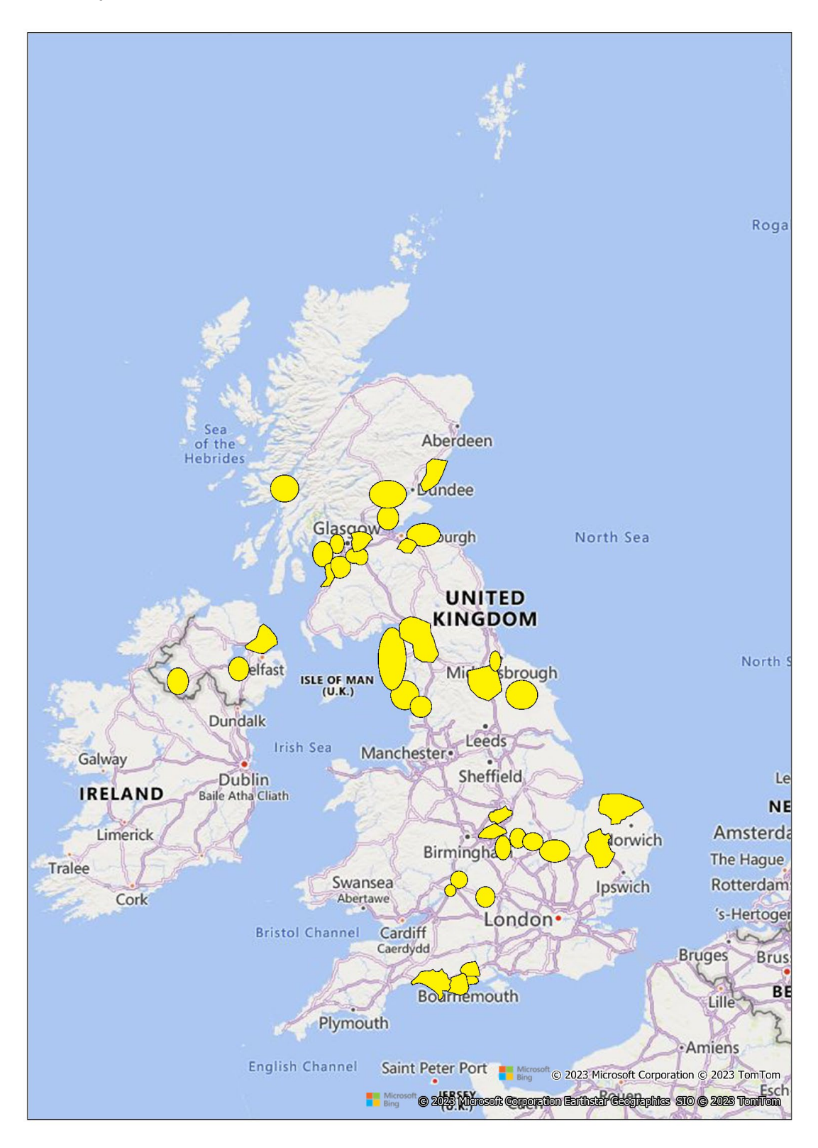
Map 1: small-scale DAB areas where interest in only running a multiplex was received from an individual respondent