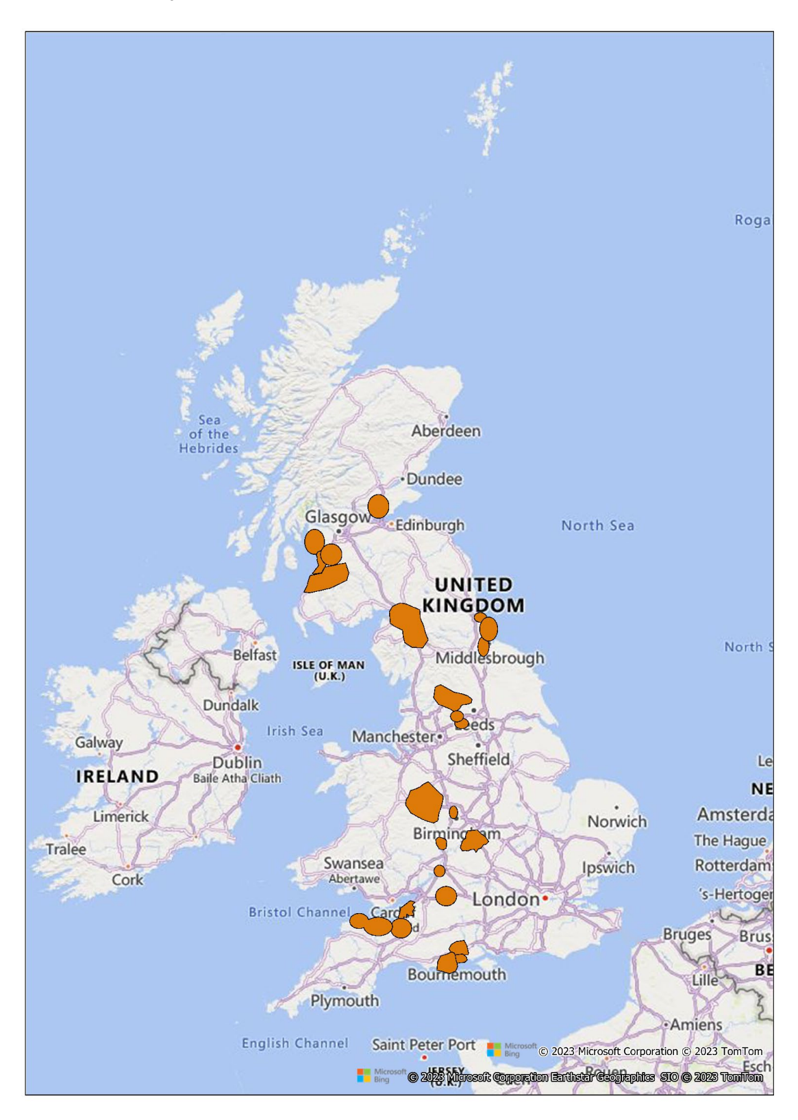
Map 2: small-scale DAB areas where interest in only operating a programme service was received from an individual respondent