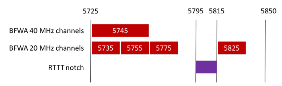
Figure 3.1: BFWA channels in the 'notched' 5.8 GHz band (all units in MHz)

3.11 Without the notch, it would be possible to accommodate six 20 MHz channels and three 40 MHz channels. We illustrate this in Figure 3.2.