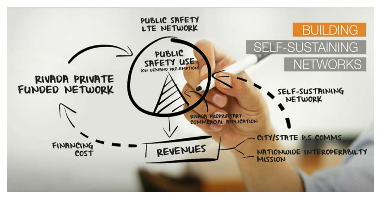
Figure 4.4-1: Self Sustaining Model: Rivada Networks' approach provides a unique operating and funding model.