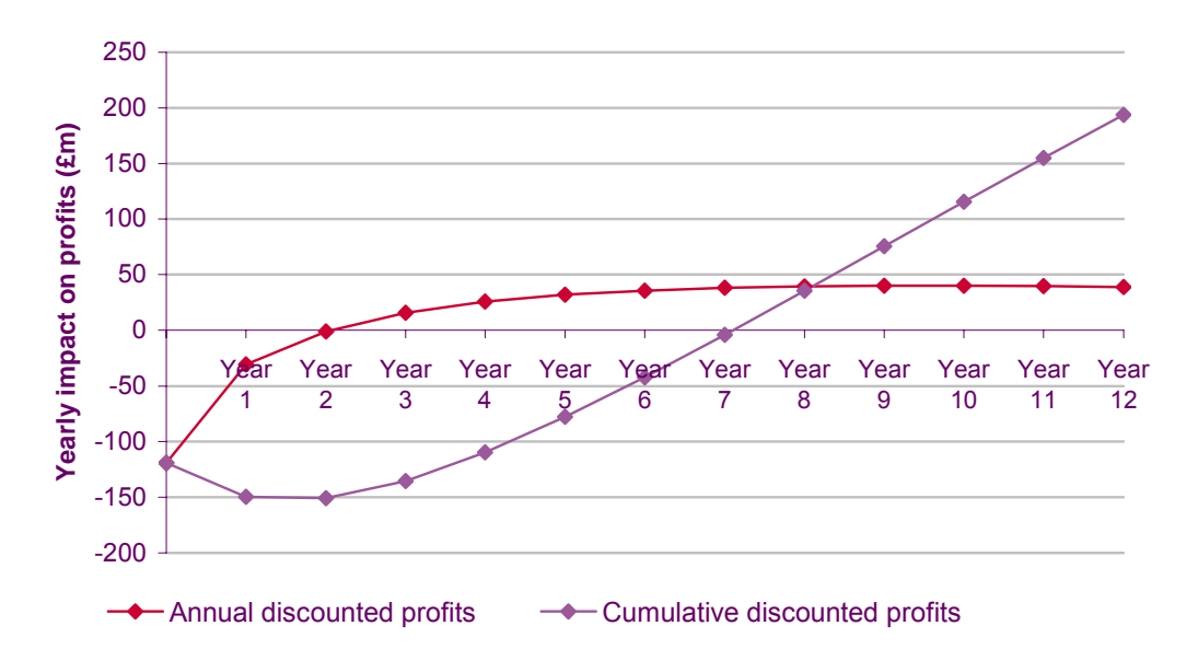
Figure 11 Profitability for Sky of decision to cease wholesale supply of premium channels to Virgin Media