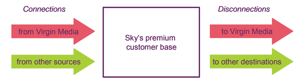
Figure 1 Simplified illustration of operator churn

3.24 As we have indicated elsewhere, the service choice of customers is highly affected by the availability of Core Premium content. A service that includes Core Premium content is likely to attract more customers than one that does not. Therefore, we would expect, all else being equal, the following consumer responses if Sky Sports and Sky Movies are no longer available on Virgin Media (but remains available in Sky's retail packages):