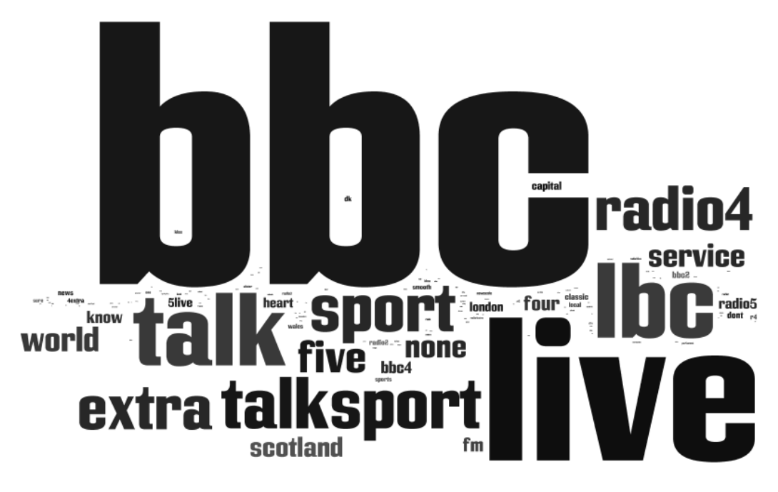
Figure 2. "Which brands/stations first come to mind when you think of speech radio (non-music content)?"

Base: All Nat Rep (1087)