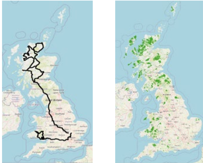
Figure 1: Overview of Ofcom’s supplementary October 2024 drive-verification route (left) and areas where Three has added coverage since 30 June 2024 (right)

measurement work previously undertaken in July and August) covered approximately 2500 miles. The majority of this work was undertaken across Scotland and Wales, where most of the additional coverage was predicted.