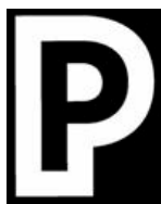
White outer P, black inner P (“Logo 1”) (the black background shown above is not part of the logo, but is for illustrative purposes here only)