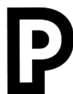
Black outer P, white inner P (“Logo 2”)