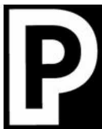
White outer P, black inner P (“Logo 1”) (the black background shown above is not part of the logo, but is for illustrative purposes here only)