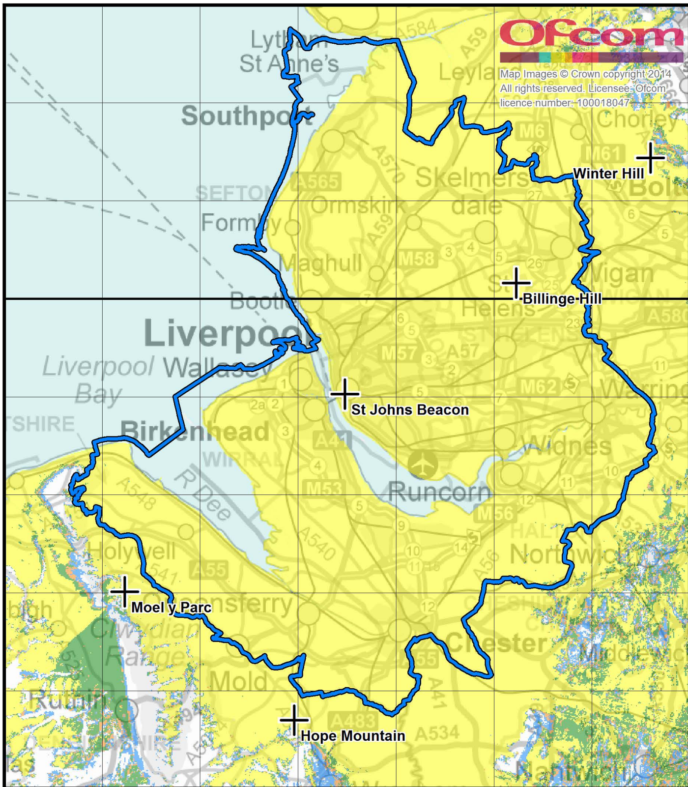
Liverpool Local DAB Multiplex Service Predicted mobile coverage normal propagation conditions, Final