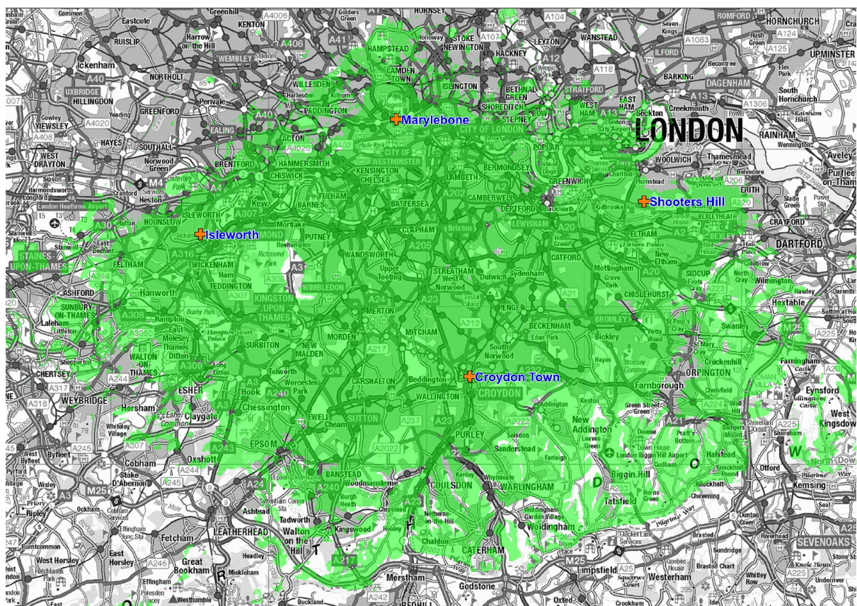
Figure 1: Predicted indoor coverage of the South London small-scale DAB multiplex. October 2025